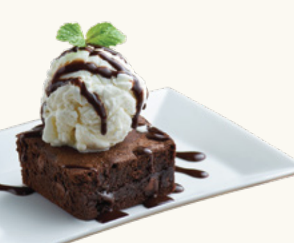
13.9 Chocolate Brownie Served with ice cream

Homemade Apple Pie 16.9 Served with ice cream & custard sauce